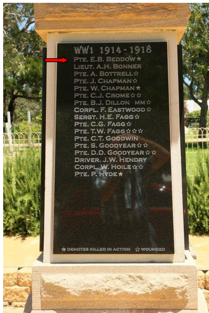
Liston/Amosfield War Memorial