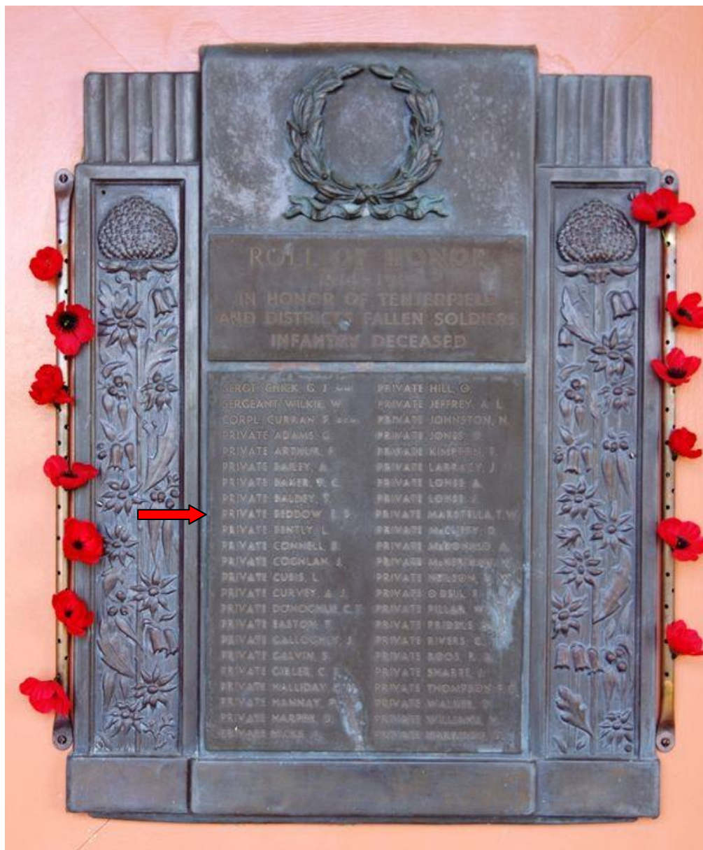
Tenterfield & Districts Infantry Roll of Honour